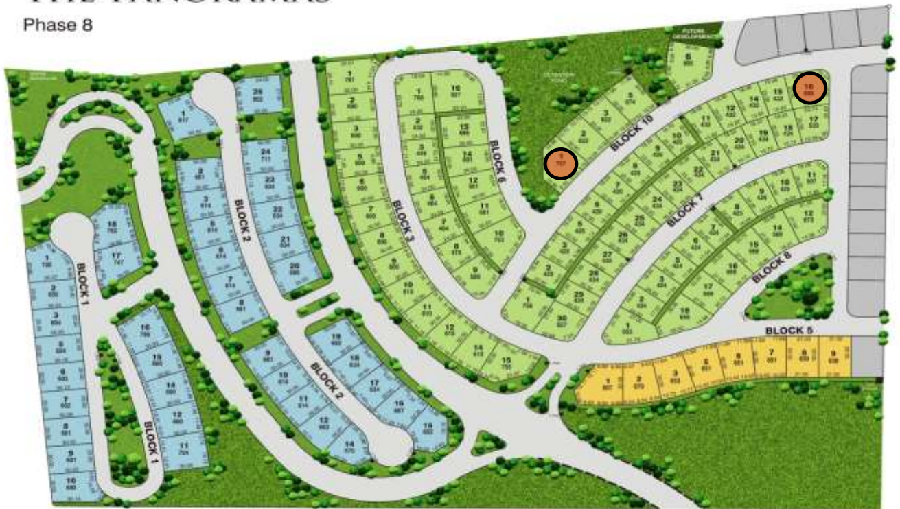
Site development plan